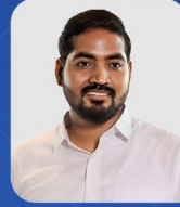
Mr. TAMIL PRABHA TAMIL LITERATURE OPTIONAL